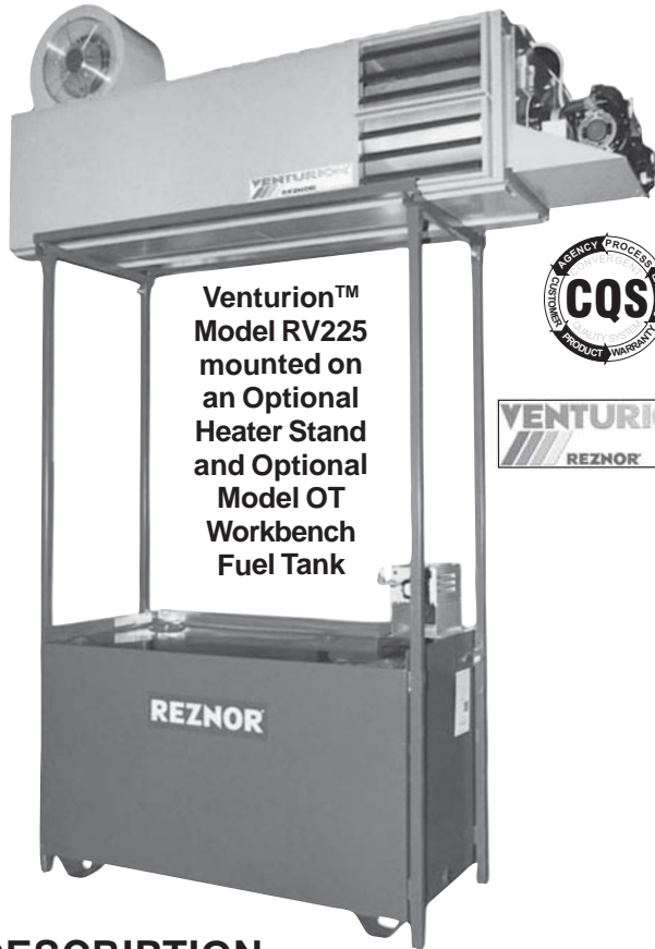
Venturion™ Model RV225 mounted on an Optional Heater Stand and Optional Model OT Workbench Fuel Tank